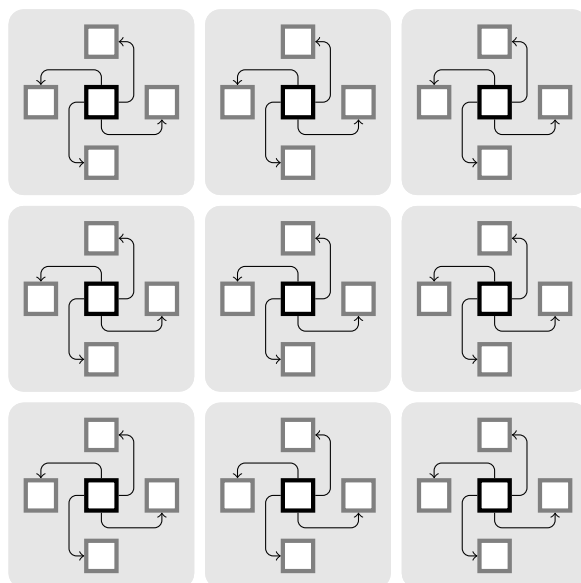
Figure 2: Emit Phase in BSCA.

The process of emit is like sending the messages from a cell to its neighbors. Each cell performs it as follows.